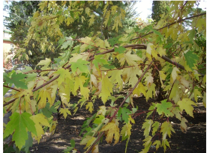
Silver maple, early fall

One of the functions of the Nursery Station was to demonstrate to farmers what trees could grow on the prairies. Although never distributed, the silver maple now graces the curved driveway near the Superintendent's Residence.